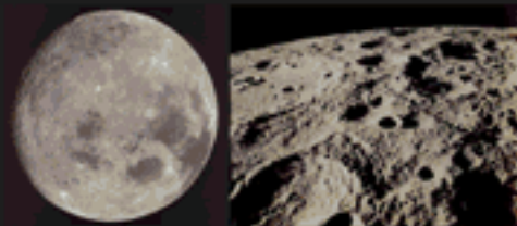
Measuring the Height of the lunar craters